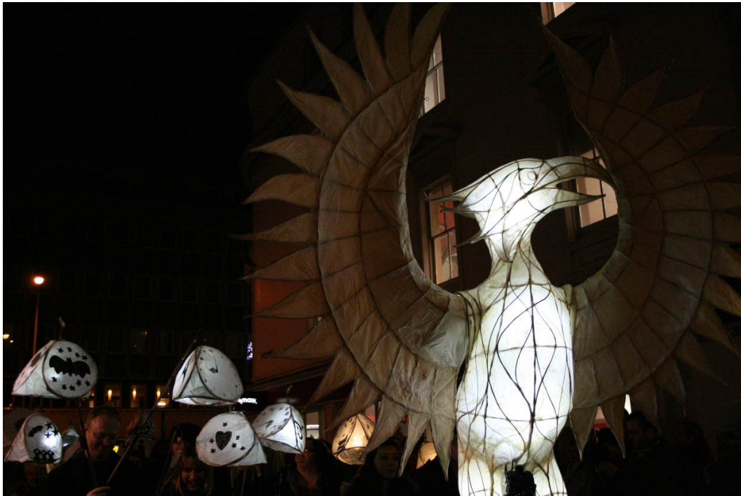
Burning the Clocks, 2011 – Bec Britain